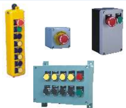
JUNCTION BOX & PBS